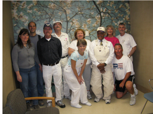
Left to Right, Front to Back: